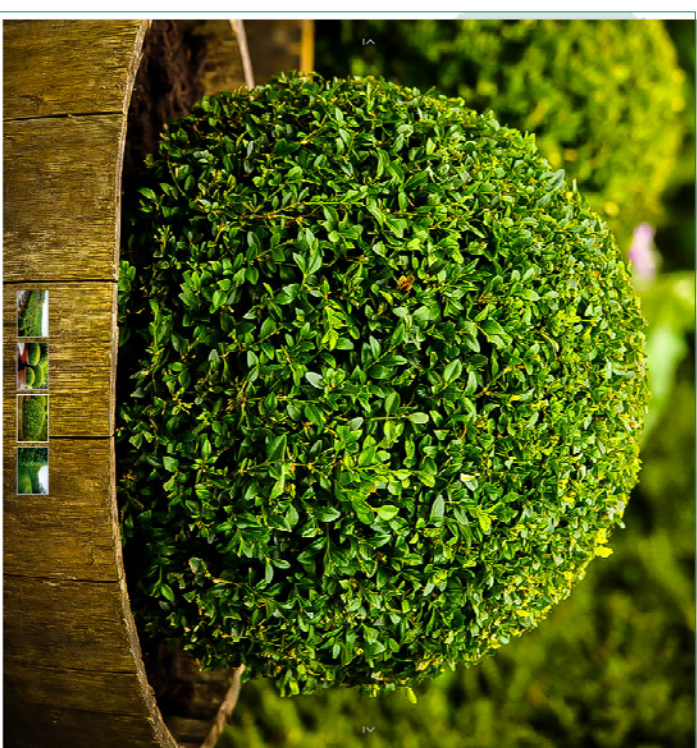
AMERICAN BOXWOOD (BUXUX SEMPERVIRENS)