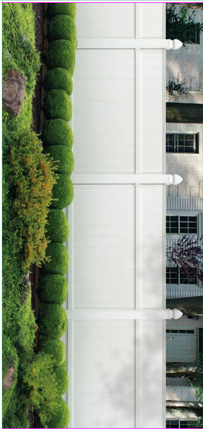
6' TOTAL HEIGHT x 6"w PANEL- WHITE WYNDHAM STYLE FENCE