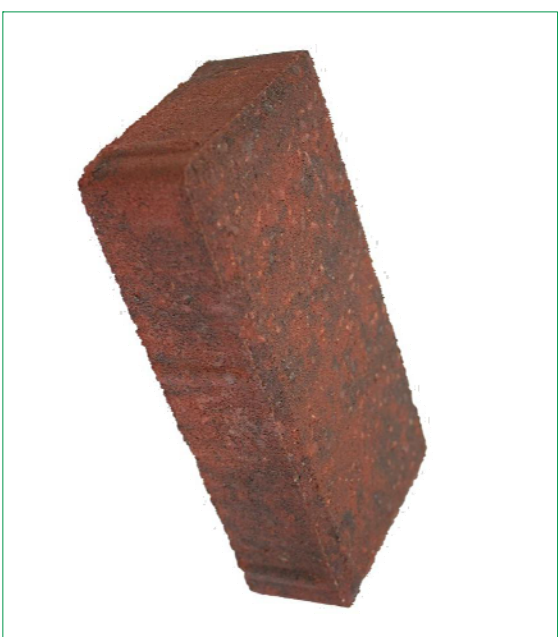
CONCRETE BRICK PAVERS