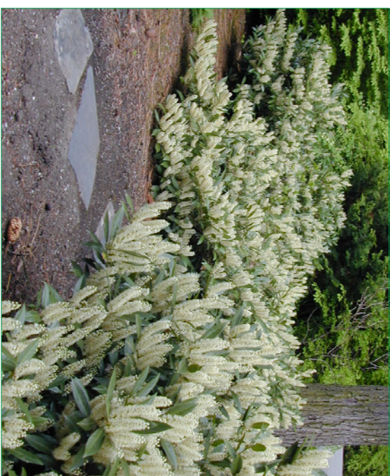
CHERRY LAUREL (PRUNUS LAUROCERASUS)